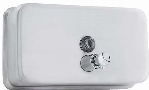
The picture belongs to VELTIA 03002.S