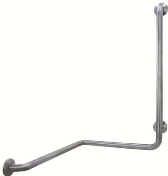
The picture belongs to NOFER 15050.S